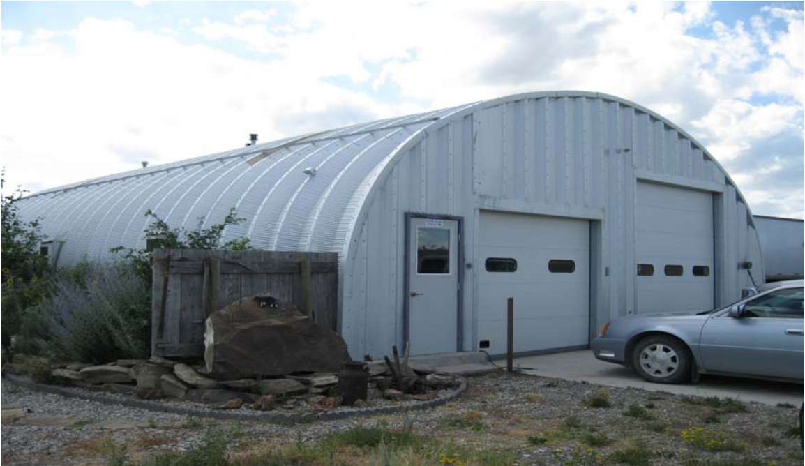
Attached to the home is a Quonset that acts as a garage and shop area.